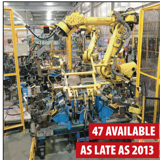
ASSORTMENT OF FANUC ROBOTS

PLEASE NOTE: ASSETS IN PRODUCTION UNTIL END OF OCTOBER. FINAL CLOSE DATE FOR OFFERS ON PRIVATE TREATY ASSETS MUST BE SUBMITTED BY MONDAY, OCTOBER 2, UNLESS SOLD PREVIOUSLY.