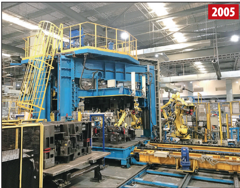
REAR DOOR LINE-DUAL STATION HEM PRESS