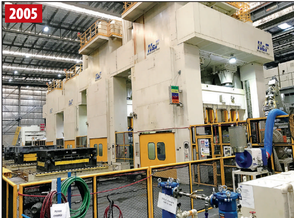
H&F PRESS SIDE PROFILE