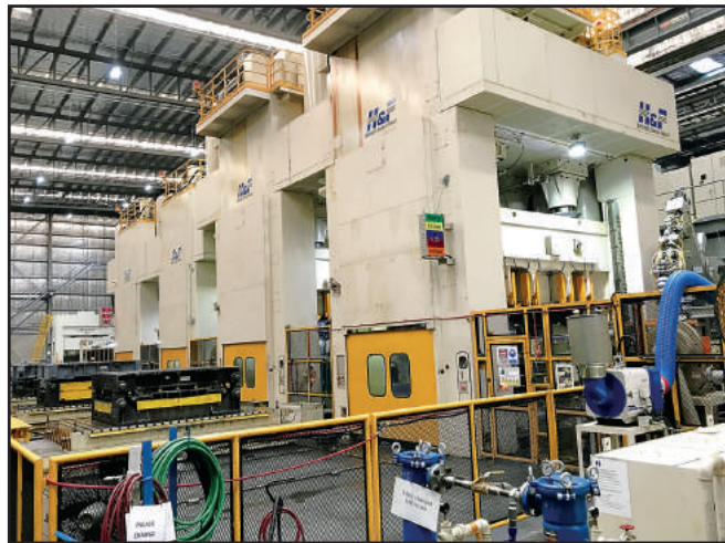
H&F PRESS SIDE PROFILE