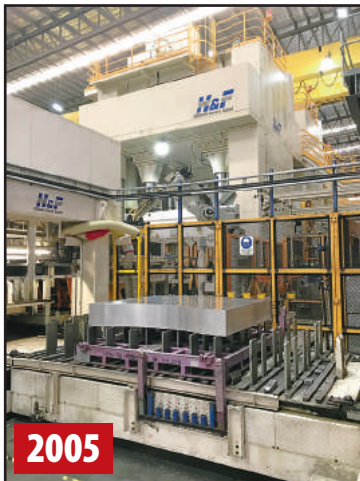
H&F DESTACKING FEEDER