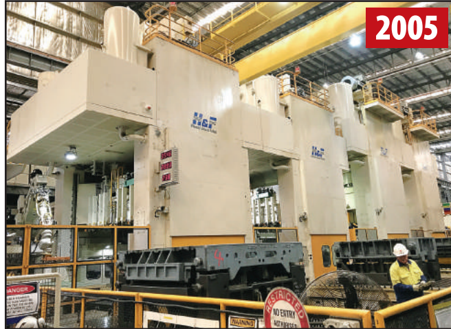
H&F PRESS SIDE PROFILE

(5) MOTOMAN EP4000 6-AXIS TRANSFER ROBOTS , 200kg Capacity, Yasnac XRC Controller