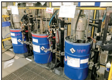
GRACO PAINT MIXERS

To discuss your requirements for an auction, please call Perfection Industrial +1-847-545-6374