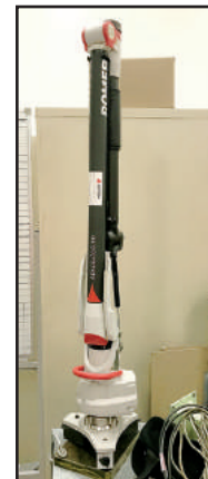
ROMER ABSOLUTE ARM PORTABLE CMM