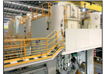
H&F PRESS CROWNS AND WALKWAYS