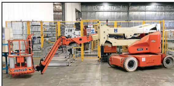
JLG E400AJP BOOM LIFT

GENERAL ASSETS FOR SALE INCLUDE: MACHINE TOOLS, GRACO PAINT MIXERS AND SEALING SYSTEMS, INSPECTION EQUIPMENT, MAINTENANCE DEPARTMENT, FANUC WELDING AND SEALING ROBOTS, ROBOT SPARES, FACILITY SPARES, MOBILE EQUIPMENT AND OFFICE FURNITURE