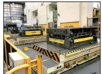
H&F ROLLING BOLSTERS