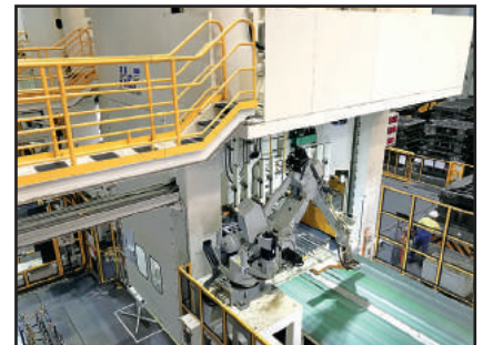
H&F EXIT CONVEYOR AND ROBOT